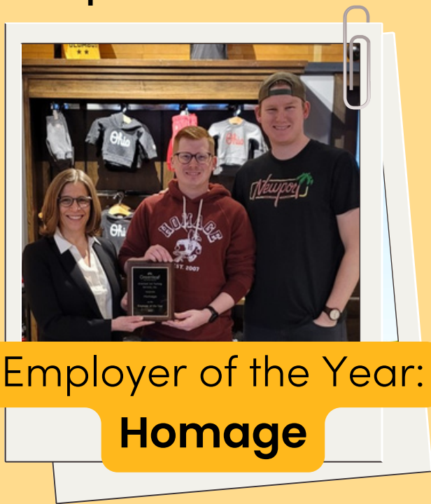
Employer of the Year: Homage